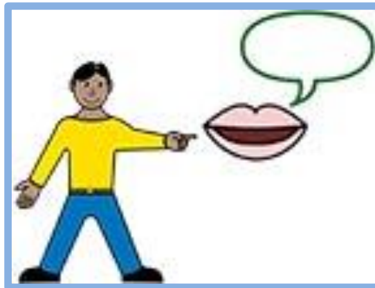
person pointing at mouth with speech icon